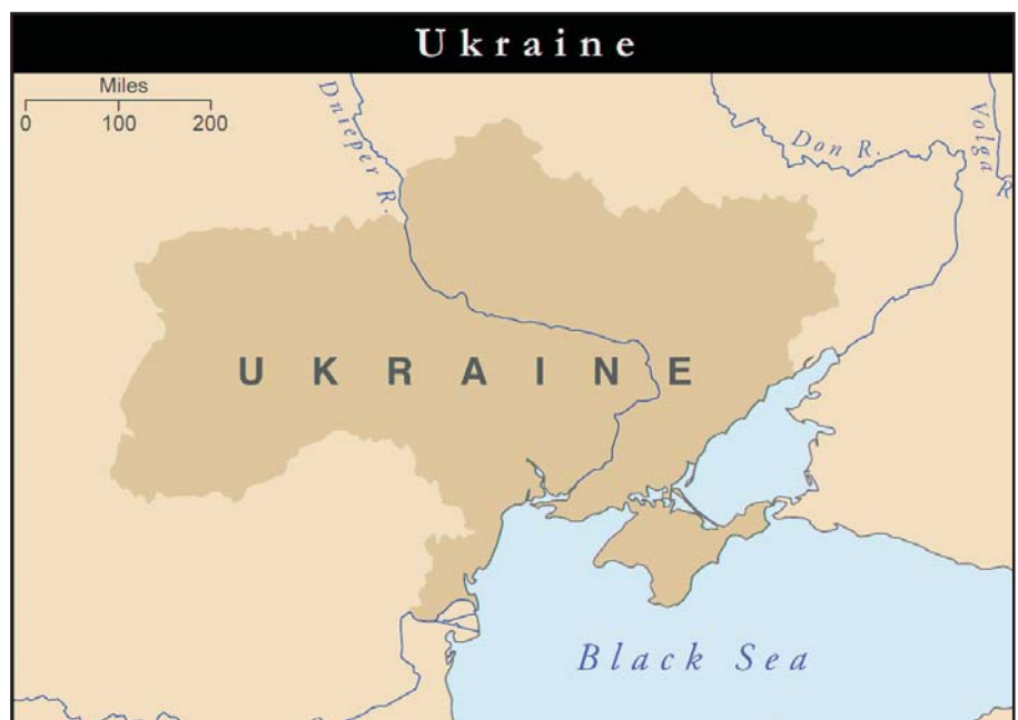
Map of Ukraine

Peter’s father told him they would be going out to hunt today. His eyes brightened because he would be able to use the spear and spear thrower his grandfather had made for him. Some of the people of the clan