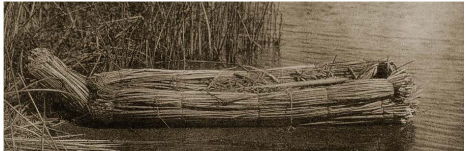
Tule reed boat

In 1542, explorer Juan Rodriguez Cabrillo sailed Spanish ships north along the Baja coast into California, landing in San Diego. There, the Spanish found plenty of scallops, clams, lobster, and crayfish in the waters. He and his men also met the Kumeyaay, descendants of the San Dieguito Paleo-Indians, then living around San Diego Bay. The Kumeyaay made nets and traps out of agave fiber to help them catch fish and the other sea life that was readily available. They wove tule reed boats, which they paddled out beyond the breakers. Out on the ocean they caught larger fish using sharp hooks carved from abalone shells and fishing lines made from yucca fibers. The Spanish settled in California, building the first mission and military fort near