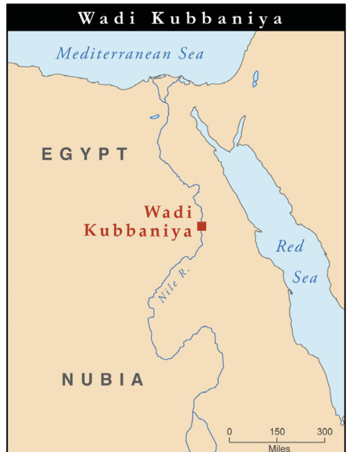
Map of Wadi Kubbania