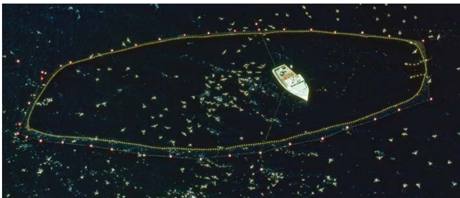
Tuna fishing with purse seine

waters (to the extent that current laws allow), just as humans have for thousands of years. Other people have started to raise fish and other living things from the sea on farms. Although the tools and techniques for gathering them may be new, our needs for these resources from the sea have never changed.