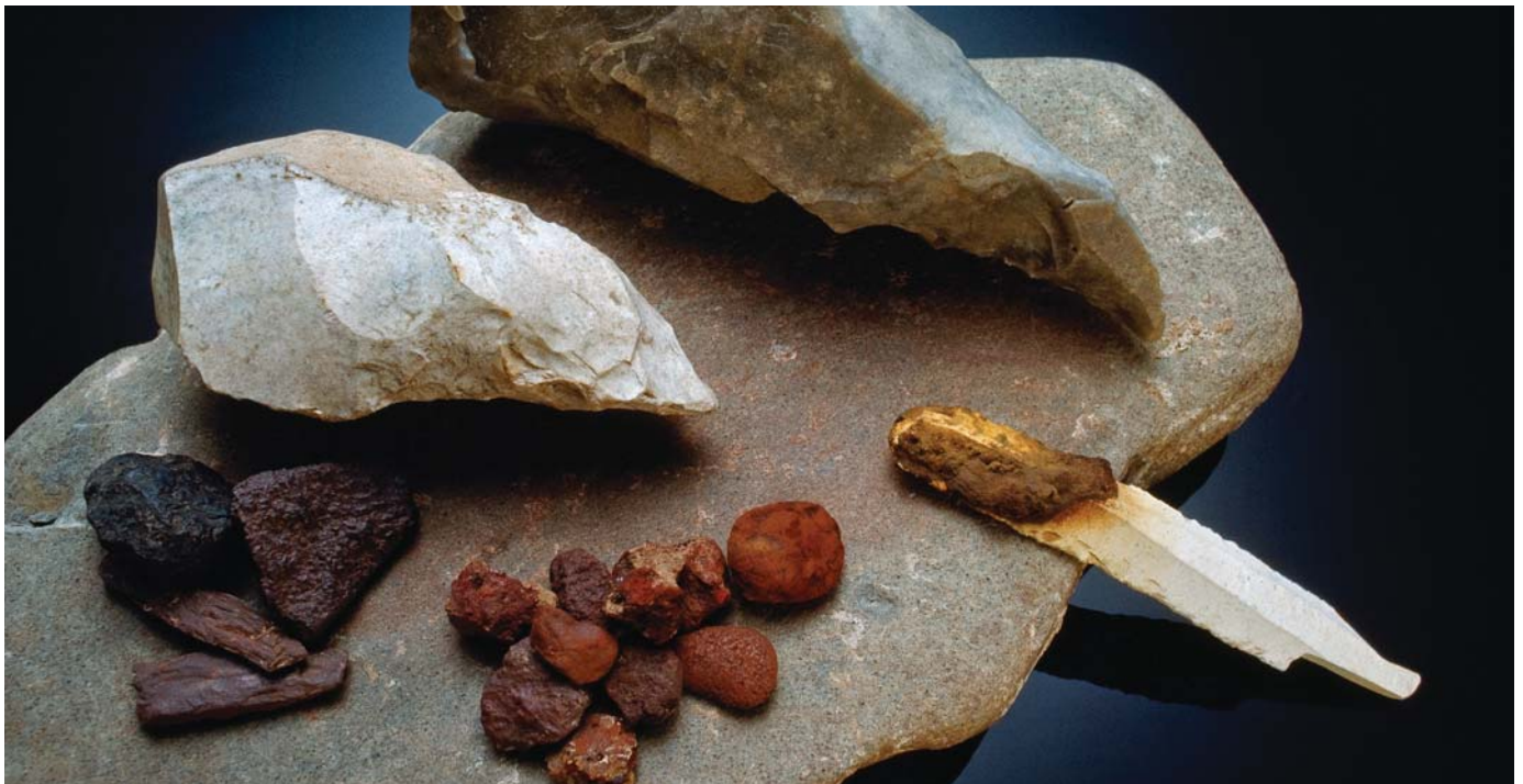
Paleolithic period stone tools

Petra knew they would soon be moving to a new location, as they had done ever since she could remember.