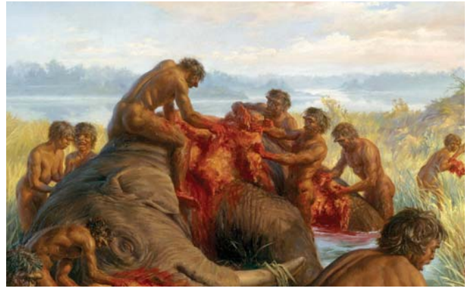
Paleolithic people scavenging mammoth

Knowing how much her little brother enjoyed eating bird eggs, she climbed a tree where she had seen birds flying in and out of a gap in the leaves and found a nest with an egg to give him.